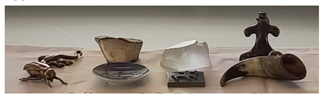
Figure 1. Totems such as figurines of a fly, a gecko, a petrified stone, a dish with a mermaid, and a tile with a centaur.

The goal of our big game is to learn to think beyond one's own paradigm by exploring pluralism in paradigms though dialogue with the more-than-human world. To ensure dialogue, the game is played in four teams with four or five players who deliberate on a question and come up with a team answer. Further, the other teams judge the quality of the answer and briefly comment on their 'yes' or 'no'. To ensure inclusion of the more-than-human world, teams play with totems that refer to Descola's ontologies (see Figure 1 for examples). Also, the powerpoint shown during the game displays a set of book covers from authors who have written about variation in paradigms (Figure 2). Totems and book covers are meant to inspire the players to think beyond their preferred paradigm. Ideally, teams could also use artefacts, animals or plants already present in the room. Finally, the only way to cross the Pálsson Line is by actually including non-humans while coming up with an answer.